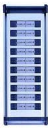
plate Flush pre-box: (L)290mm/(W)100mm/(H)55mm Surface pre-box: (L)323mm/(W)120mm/(H)55mm Double pre-chassis: (L)323mm/(W)270mm/(H)45mm Double Surface pre-box: (L)323mm/270mm/(H)45mm

W/O prebox: 325x120x60mm Packing: 0.13 cubic ft Weight: 1.5 kg Need Prebox