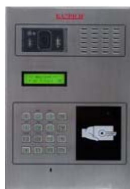
SUS316 Stainless Steel

Power In: DC15~18V by Adaptor Resolution: Color- 480 TV line Lens: Auto CCD: 1/3" Color CCD F1.8/3.6mm,Full angle 92 Degree Min. illumination: 0.1Lux at 4 white LEDs Material: Stainless Steel Dimensions: 300x200x75mm Packing: 0.25 cubic ft Weight: 2.9 kgs Need Prebox with Inductive Card Reader Editing by remote control system Memorize 2,500 pcs Inductive Cards (EM/ Mifare Card) Stainless steel+ Back light Keypad