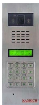
SUS304 Stainless Steel

Flash Demo of PH-855C7 Power In: DC15~18V by Adaptor Resolution: Color- 480 TV line Lens: Auto CCD: 1/3" Color CCD F1.8/3.6mm,Full angle 92 Degree Min. illumination: 0.1Lux at 4 white LEDs Material: Stainless Steel Dimensions: W/prebox: 325x120x80mm (w/flush mounting prebox) W/O prebox: 325x120x60mm Packing: 0.13 cubic ft Weight: 1.5 kg Need Prebox Front panel+inner box+ keypad: SUS304 Back light Keypad 500 password for door open code European Style + Memory your name in Camera